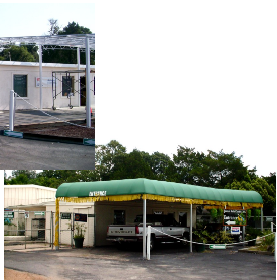
The Final Product 17 kW Grid Tied Photovoltaic System September 2011